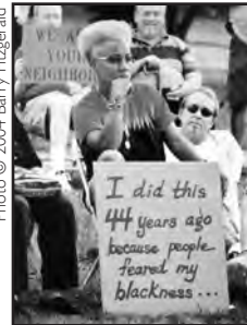
Protesting HB-751 in Virginia